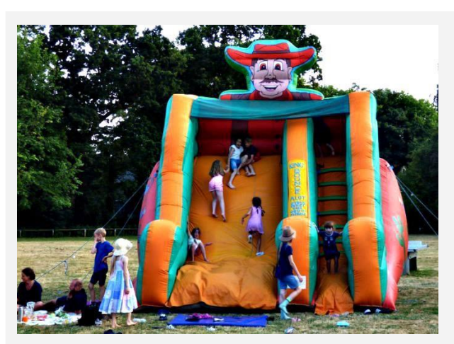
Almost time for Horningsea Village Day!