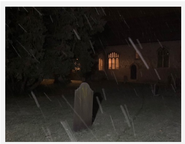
Candlelit Carol service is on the 8th Dec.